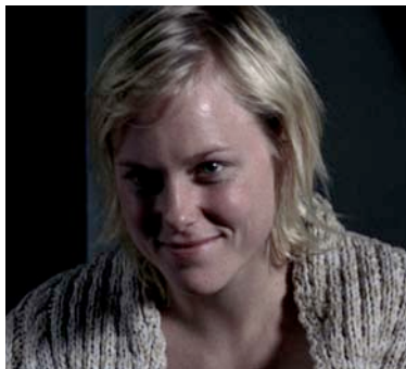
Ingrid Bolsø Berdal as "Norunn"

" Hans " is played by Henrik Mestad , an actor, stageplay director and multi-discipline talent known from a string of stage productions and roles in the features "United", "The Greatest Thing" and "The Seven Deadly Sins". Mestad is currently working at the Torshov Theatre in Oslo, and will appear in several upcoming Norwegian feature films in addition to "Sons".